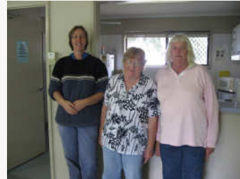
In the Kitchen