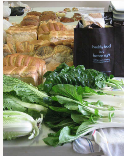
Emergency food, bread and vegetables from gardens

Food relief is an important emergency support mechanism for people experiencing food insecurity but the nearest centre providing emergency food was 6 kms away and not easy to get to by public transport so it was decided to offer emergency food relief at Tallowood. Our community nutritionist worked with the community volunteers who would be responsible for administering the program to develop their policy and procedures and to look at what kind of foods would benefit families to make a number of nutritious meals, including food that could be taken to school. The centre also provides information about other services in the region offering emergency relief.