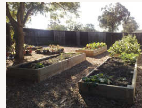
New vegie garden beds

The household food security survey asked for preferred strategies people would like to see happen in their local community to alleviate food insecurity and improve people's access to food and growing fruit and vegetables was a very common response.