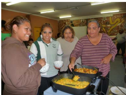
Participants in an Aboriginal community kitchen

Session 2 provided an opportunity to hear about some of the many innovative and exciting projects which are underway, from local councils, regional food alliances, an Aboriginal community kitchen, farming innovations, food security in neighbourhood settings and new distribution systems.