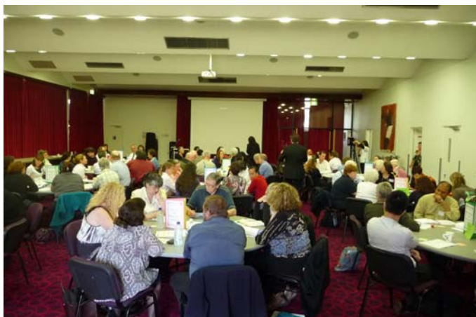
Participants in the Macarthur regional forum 15.9.09

The Summit was the culmination of several months of lead-up events, starting with a launch in NSW Parliament House in May, followed by 6 packed regional forums held across the Greater Sydney area in the Illawarra, Blue Mountains, Central Sydney, Central Coast and Macarthur between July and September.